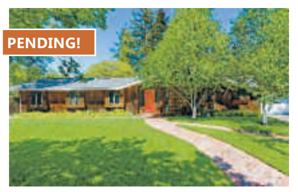
39 Ashford Place, Moraga $1,475,000 Corliss area cul-de-sac. Huge Yard! Lovely 4 bedroom home with private yard & pool.