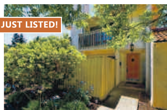
1392 Camino Peral, Moraga - $525,000 3BR / 2.5BA 1348 SQ FT Charming Townhome in Great Location!